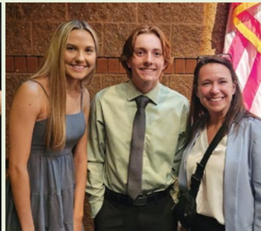
Princeton High School