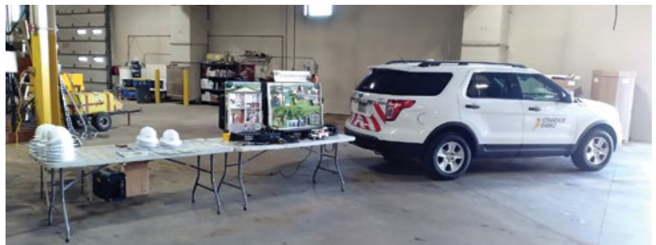
Our Hazard Hamlet program for elementary students helps reduce electrical accidents, prevent injuries, and save lives.