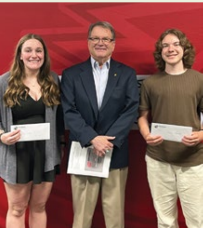
Centennial High School

To support the post-secondary education of Connexus members' children, 63 scholarships were awarded at 23 high schools. The Connexus Energy Foundation SM awarded $59,000 in high school scholarships. Our Board of Directors attended award ceremonies in their districts to personally congratulate these students.