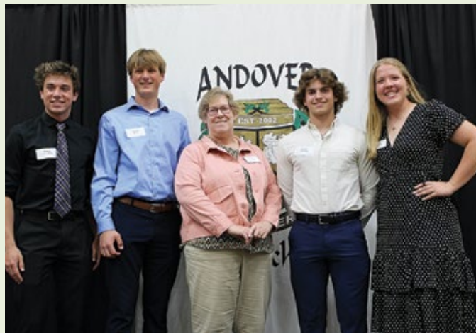
Andover High School