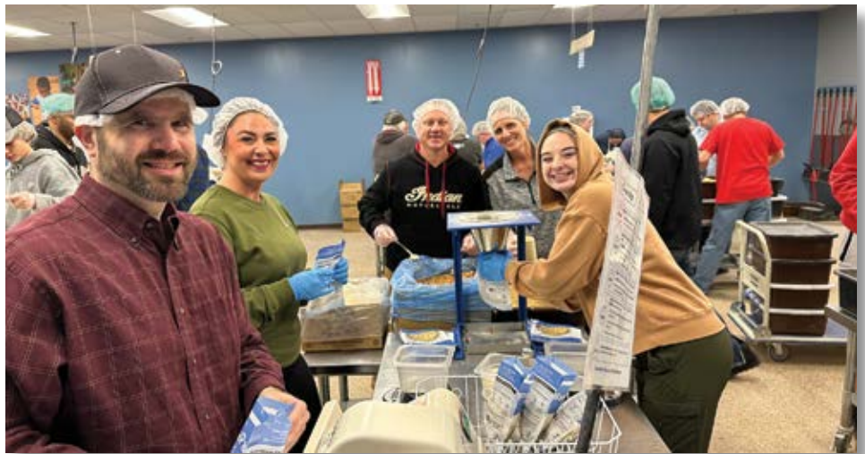
Over 50 employees, family, and friends signed up for our 10 th annual Feed My Starving Children packing event in Coon Rapids. They helped pack 33,900 meals.