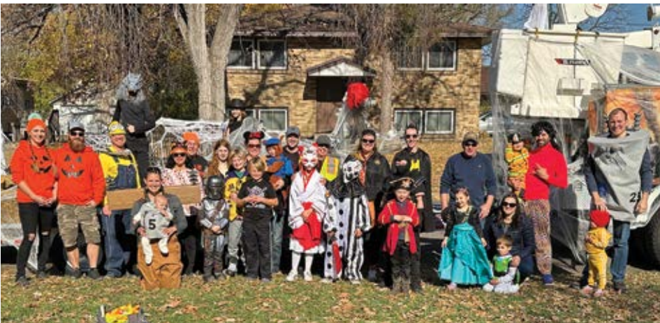
About 30 Connexus employees, family, and friends helped with our Anoka Halloween Grande Day Parade float, passing out over 400 pounds of candy!