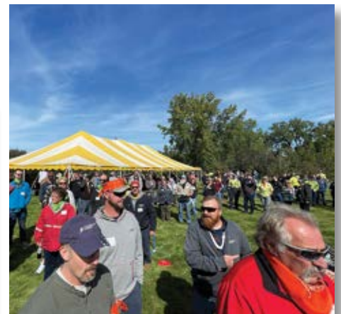
Employees enjoyed an outdoor lunch followed by team yard game competitions at this year's picnic. Each team had coordinating bandanas or leis.