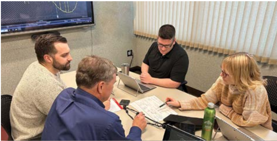
Connexus employees discussing power supply issues.

Seven core values drive how our 200+ employees operate and make decisions, both individually and as a cohesive team. Those core values are safety always, service driven, collaborative, empowered, innovative, integrity, and respect all.